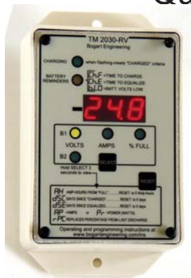
TM-2030 Battery Monitor