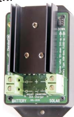
SC-2030 Solar Charger